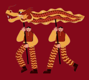
CNY ON-GROUND ACTIVATION

Pump up the festive energy with our exciting CNY music videos that resonate with the whole nation.